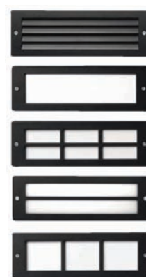
step light 1