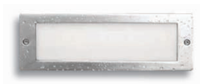
step light 6